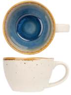
MUG 20 CL