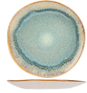
DESSERT PLATE 22,5 CM