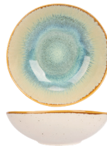
BOWL 20 CM