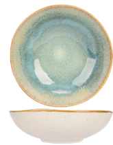
BOWL 24,5 CM