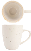
MUG 30 CL