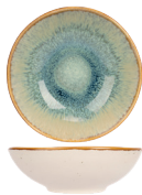
BOWL 15,5 CM